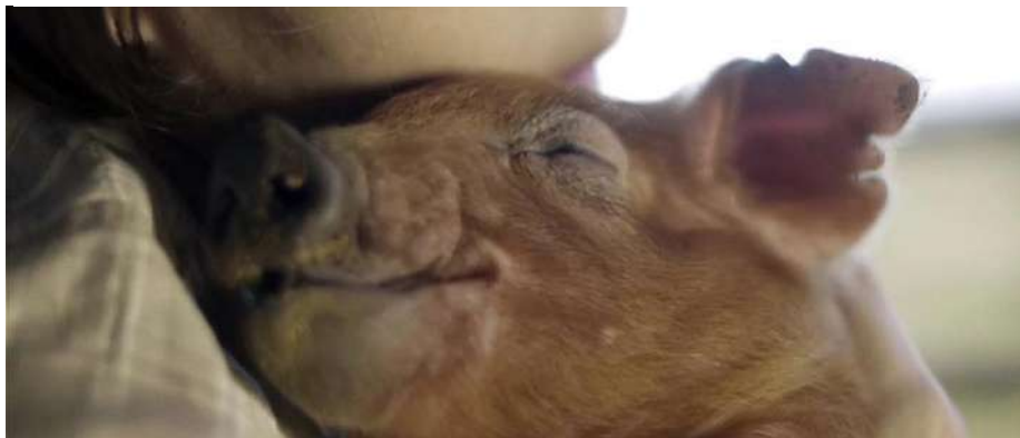
(Fig. 2) Kris comforts and is comforted by a pig in the final shot of Upstream Color.