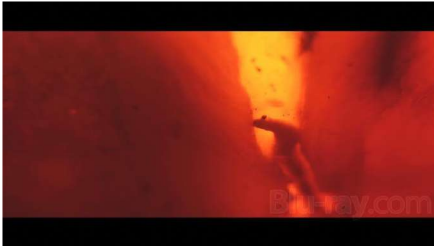
(Fig. 1, 3-5) Palettes corresponding with Romantic and Expressionist themes and symbols are used to characterise associative connections in Upstream Color.